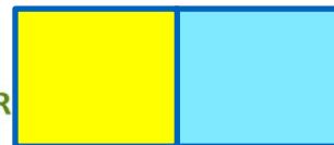
Table 1.1 Summary of Areas Agreed, Not Agreed or those which are Outstanding for Receptor Topic Areas Raised by TH